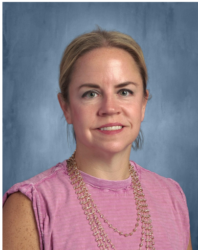
Ms. Porter current 10th gr AP